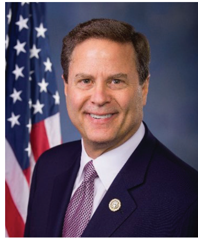
REPRESENTATIVE DONALD NORCROSS