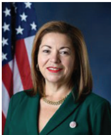
REPRESENTATIVE LINDA SÁNCHEZ