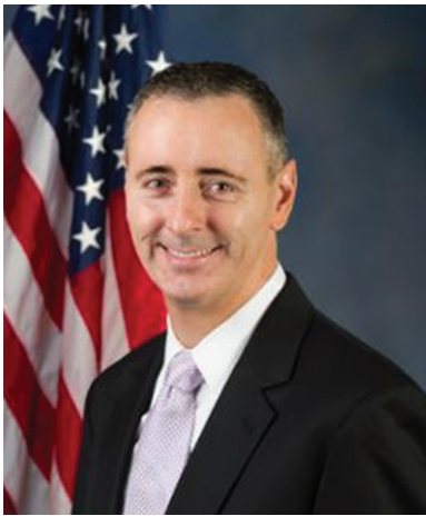
REPRESENTATIVE BRIAN FITZPATRICK